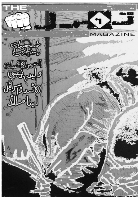
Cover of the second issue of Tamarrod.