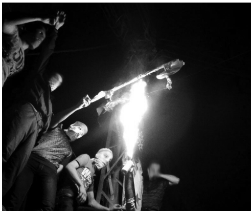
Al Mashhad. The flag burns.