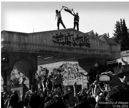
University of Aleppo 17-05-2012