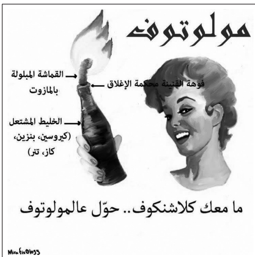
Poster. "Choose Molotov"